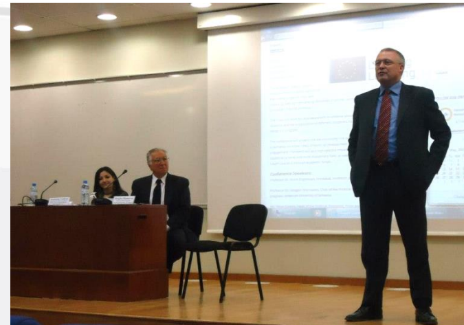
UK Ambassador to Armenia at AUA