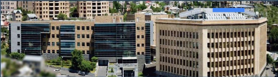
Paramaz Avedisian Building