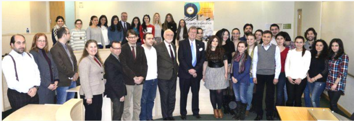
US Ambassador to Armenia Discusses US Foreign Policy with PSIA Students